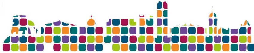
EXHIBIT AT THE